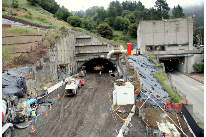
Figure 1. Existing West Portal of the 3 rd bore and new 4 th bore.

Owner: Contra Costa Transportation Authority / CALTRANS